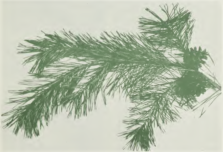
Scotch pine. (About one-third natural size)

Scotch pine ( Pinus sylvestris ), with enough open space, grows into a shapely tree (as do other evergreens grown under similar conditions) and so is very popular and brings a good price to growers. It